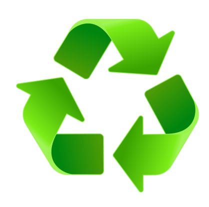
Examples of image styles to avoid on Iowa.gov